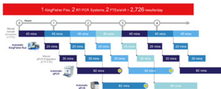
Figure 2. Increasing sample throughput using a staggered workflow.