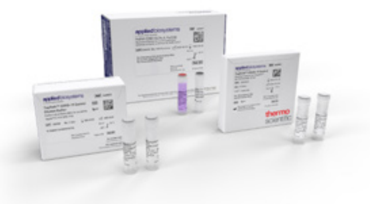
Table 1. Description and components of the TaqPath COVID-19, Flu A, Flu B Combo Kit (Cat. No. A49868).

The Applied Biosystems™ TaqPath™ COVID-19, Flu A, Flu B Combo Kit is a qualitative, emergency use–authorized (EUA), real-time reverse transcription polymerase chain reaction (RT-PCR) multiplex assay intended for the simultaneous detection and differentiation of SARS-CoV-2, influenza A, and influenza B viral RNA in nasopharyngeal (NP) swab and anterior nasal swab specimens collected from individuals with suspected respiratory virus infections and COVID-19 symptoms. The kit components and controls are listed in Table 1.