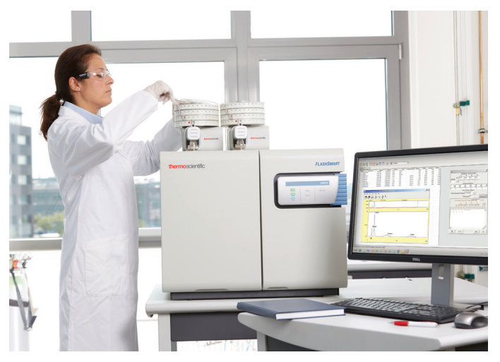
Figure 1. Thermo Scientific FlashSmart Analyzer.

The Thermo Scientific<sup>™</sup> Flash Smart <sup>™</sup> Elemental Analyzer (Figure 1) is equipped with two totally independent furnaces allowing the installation of two analytical circuits that can be used sequentially and are completely automated through the Thermo Scientific<sup>™</sup> MultiValve Control (MVC) Module (Figure 2).