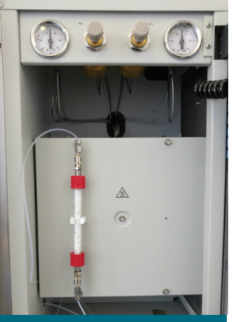
Adsorber Filter and Oven