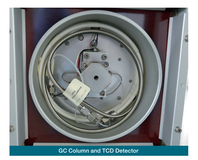
Figure 4. FlashSmart CHN and Oxygen internal circuits.

The EagerSmart Data Handling Software page managing the MVC module. Figure 5 shows in the lower part how to switch from left to right furnace to pass from CHNS determination by combustion to oxygen analysis by pyrolysis. The upper of the page indicates how to switch from helium carrier gas to nitrogen or argon gas when the instrument is not used for analysis.