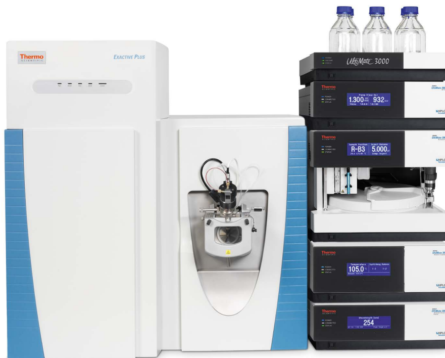
Exactive Plus mass spectrometer with Thermo Scientific™ Dionex™ UltiMate™ 3000 Rapid Separation LC system