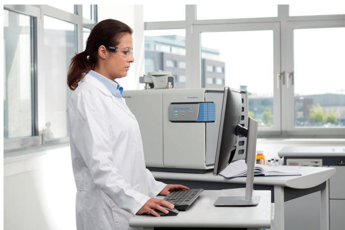
Figure 1. Thermo Scientific FlashSmart Elemental Analyzer.

Furthermore, the importance of sulfur testing in food products has grown in recent years and many of the classical methods are now no longer suitable for routine analysis. Sulfur analysis could be another test to perform to evaluate the yeast quality.