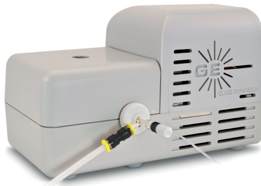
Figure 2. GE IsoMist Peltier Cooled Spray Chamber with nebulizer.

The results (Table 3) show that all element recoveries fall within acceptable limits of \pm 5\% of the true values. The relative standard deviation (RSD) of the three replicates of the spiked blank are below 1.5% for all elements, with the vast majority being below 0.5%. For the majority of analyzed elements, the method detection limits (MDL) are in the single digit \mu\text{g}\cdot\text{kg}^{-1} range or lower.