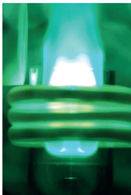
Figure 1. Plasma aspirating naphtha after auxiliary and nebulizer gas flows have been optimized.

The GE IsoMist was set to -10\text{ }^\circ\text{C} to reduce the volatility of the samples to be within the range of the plasma load that the instrument can handle. Naphtha was then aspirated into the IsoMist and the plasma position in relation to the coil was observed. The auxiliary gas flow was adjusted until the base of the plasma was half way between the top of the auxiliary tube and the base of the load coil. The nebulizer gas flow was adjusted until the green sample channel was just below the top of the torch (Figure 1). The radial viewing height was adjusted to the height that gave the best signal-to-background ratio for all of the elements to be analyzed. Associated plasma gas settings for sample introduction are shown in Table 2.